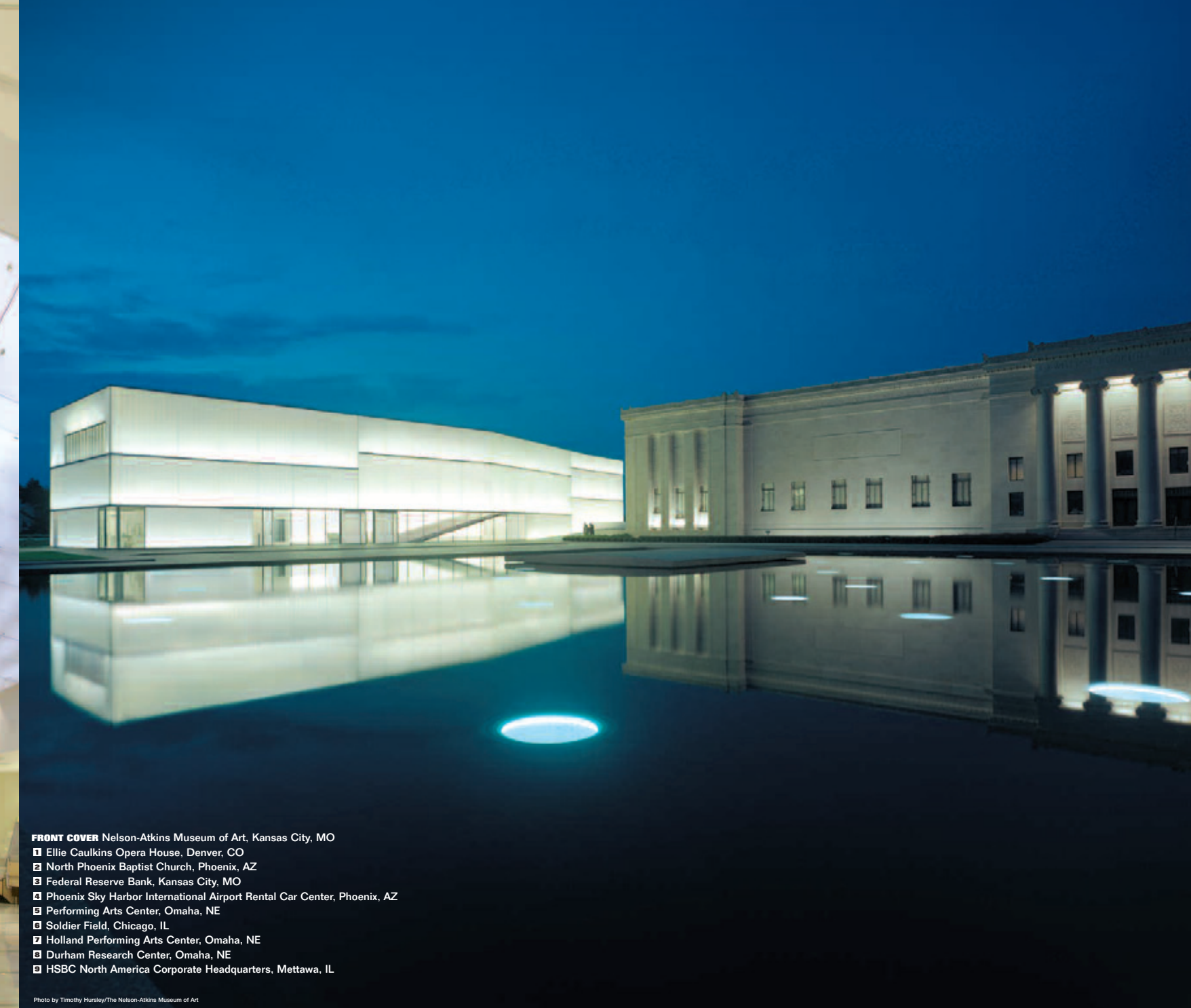
FRONT COVER Nelson-Atkins Museum of Art, Kansas City, MO ■ Ellie Caulkins Opera House, Denver, CO ■ North Phoenix Baptist Church, Phoenix, AZ ■ Federal Reserve Bank, Kansas City, MO ■ Phoenix Sky Harbor International Airport Rental Car Center, Phoenix, AZ ■ Performing Arts Center, Omaha, NE ■ Soldier Field, Chicago, IL ■ Holland Performing Arts Center, Omaha, NE ■ Durham Research Center, Omaha, NE ■ HSBC North America Corporate Headquarters, Mettawa, IL